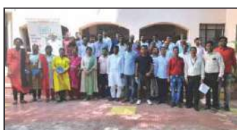
ETI - 28 th Feb 2020