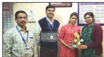
ETI - ACA Felicitation 31 st Jan 2020