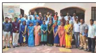
ETI - ACA 3 rd March 2020