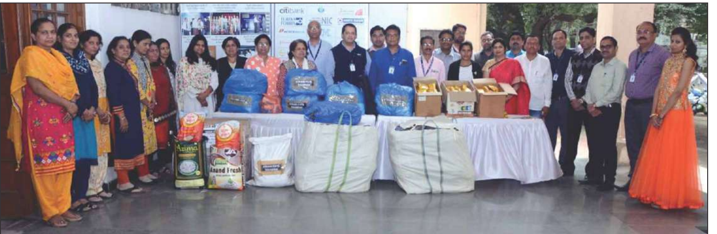
Donations to 'Snehabandh', 'Athare Patil Bal Gurha', 'Green Sole', Navi Mumbai NGO & 'Utkarsh Balghar