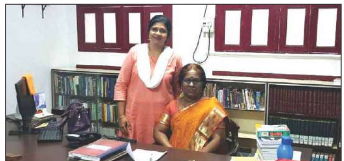
Connemara Public Library, Chennai - 6 th June 2019