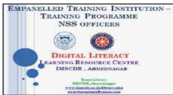
Digital Literacy presentation