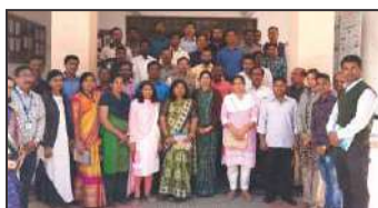
ETI - ACA 31 st Jan 2020