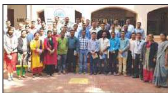
ETI - NSS 14 th Feb 2020