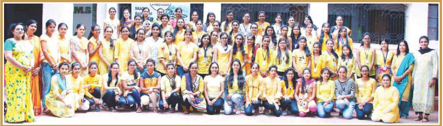
The Vidyarthini Manch's Yellow Day observed on 3 rd Oct 2019.