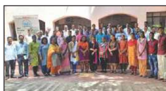
NSS - 11 th March 2020